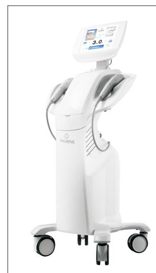
Fig. 1. High-intensity focused ultrasound (I-SHURINK®).

We compared the preoperative and postoperative measurements with the Global Aesthetic Improvement Scale (GAIS) at 2 weeks after the first procedure, 2 weeks after the second procedure, 2 weeks after the third procedure, and 6 weeks after the third procedure. Each scoring sheet