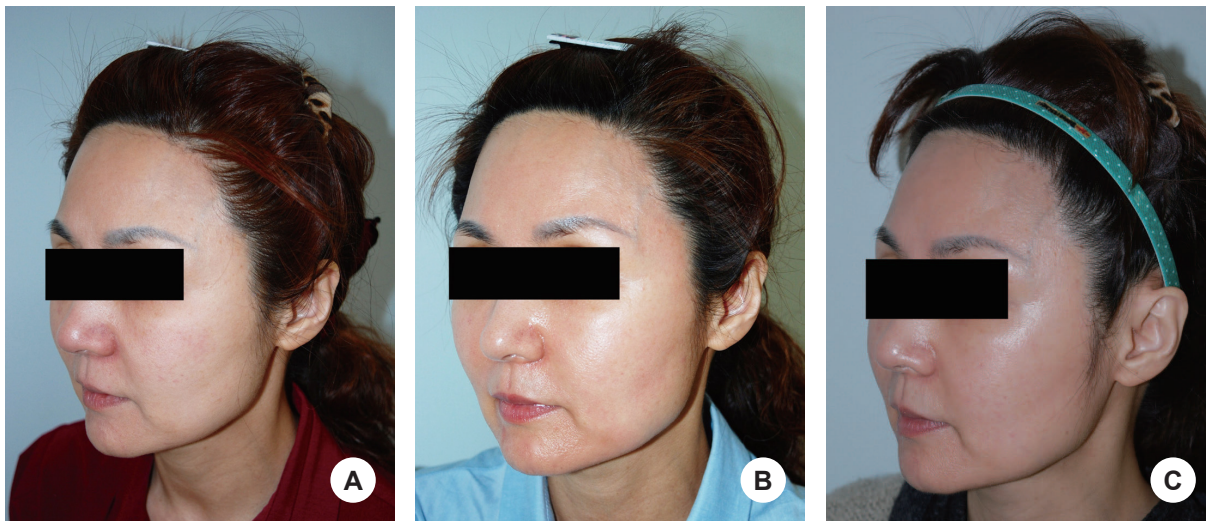
Fig. 2. A 46-year-old female patient with moderate skin sagging and wrinkling. At pre-treatment, she was examined by the automatic skin diagnosis system and was given a skin grade score of 5 (A). At 2 months post-treatment, the skin grade score was 2 (B). At 4 months post-treatment, the skin grade score was 4 (C).

abnormalities. Hypopigmentation, hyperpigmentation, ulceration, and erosion were not present in any patients. There were no adverse events, such as nerve or muscle dysfunction, severe pain, bruising, and bleeding. The median skin grade scores were 5 (4-5) at pretreatment, 3 (2-3) at 2 months post-treatment, and 3 (3-4) at 4 months post-treatment (Fig. 1 and Table 2). After comparing pre-treatment and 2 months post-treatment, pre-treatment and 4 months post-treatment,